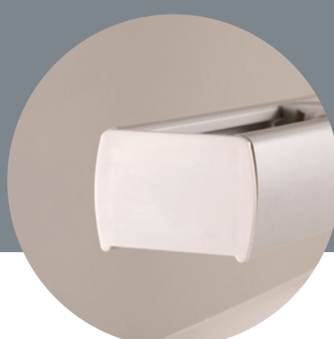
Designer Steel Headrail