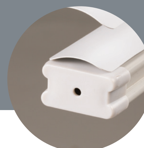
Bottom Rail of Roll Formed Metal